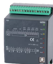
P43 - three-phase transducer of power network parameters.

For more information about LUMEL's products please visit our website: www.lumel.com.pl